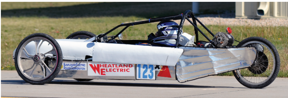
Wheatland sponsored ElectroRally teams from Great Bend and Scott City (above).