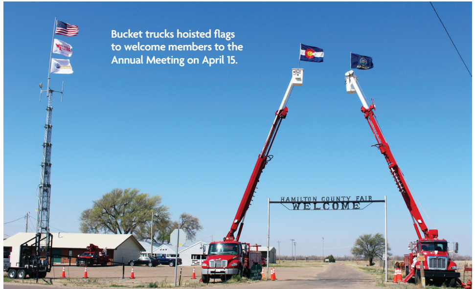
Bucket trucks hoisted flags to welcome members to the Annual Meeting on April 15.