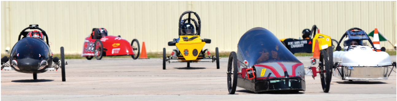
Twelve high school teams competed at the 18th Annual Sunflower ElectroRally on April 22 in Scott City.

Twelve teams from across the state (and one from Florida) competed in the Sunflower ElectroRally on April 22 at the Scott City Airport.